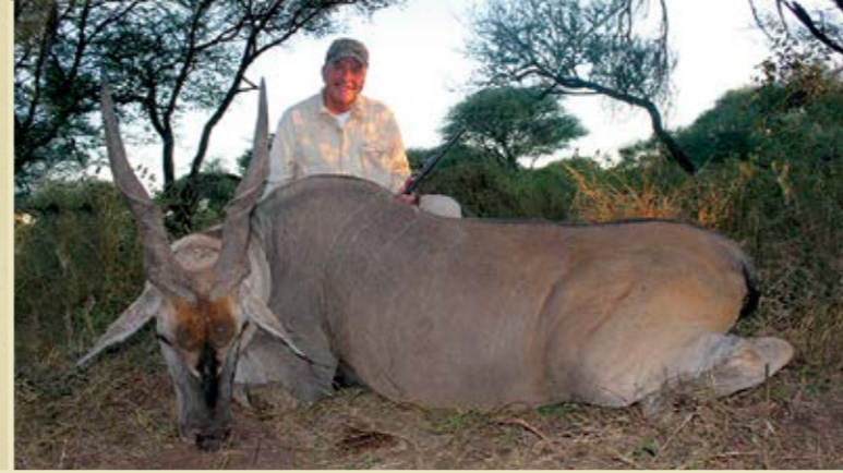
Spiral Horn Bonanza